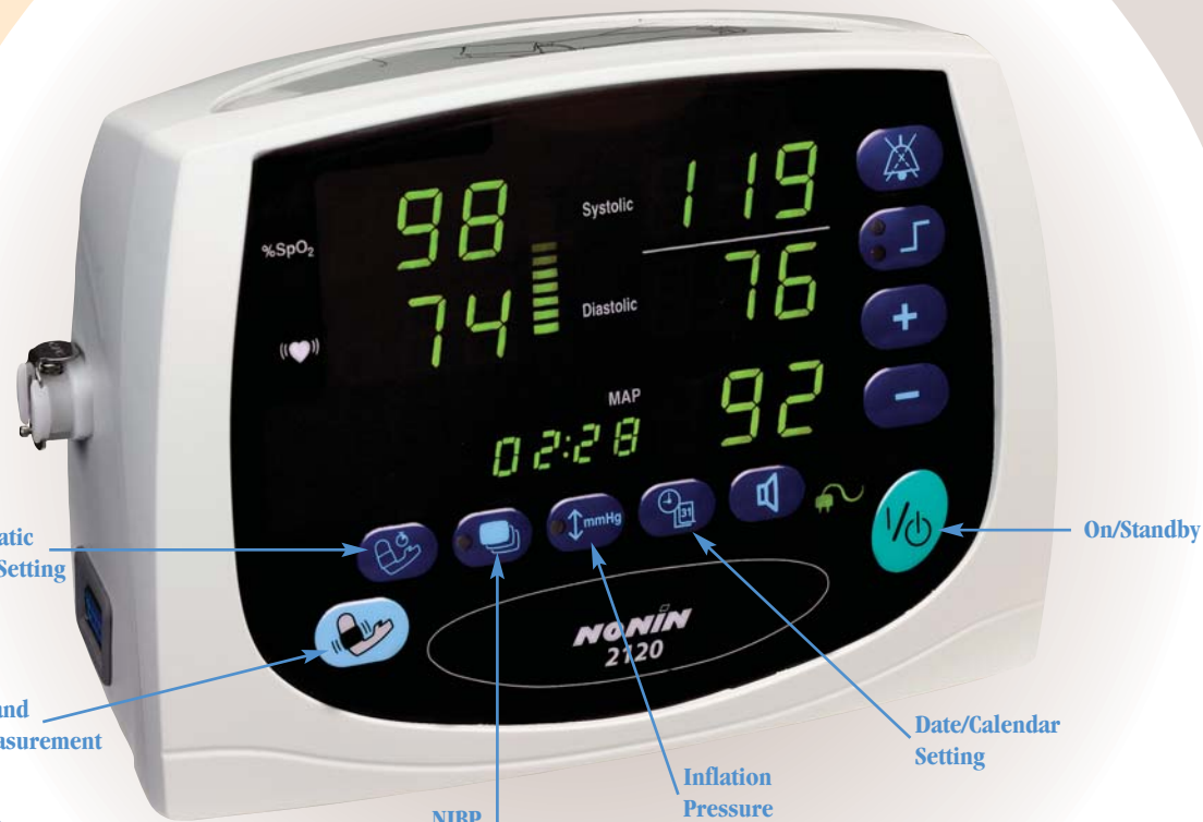
Automatic Mode Setting